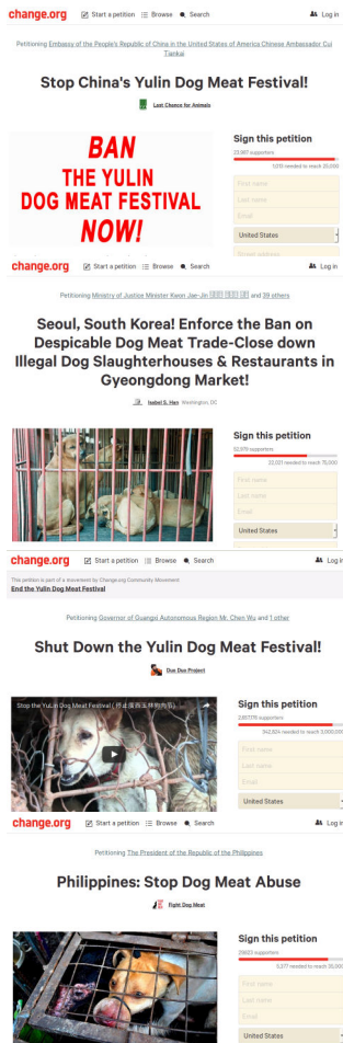
Figure 1: Examples of similar petitions. It is easy to find many petitions against the Yulin dog meat festival.